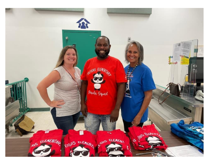
Join the PTA @ PetersPTA.memberhub.com