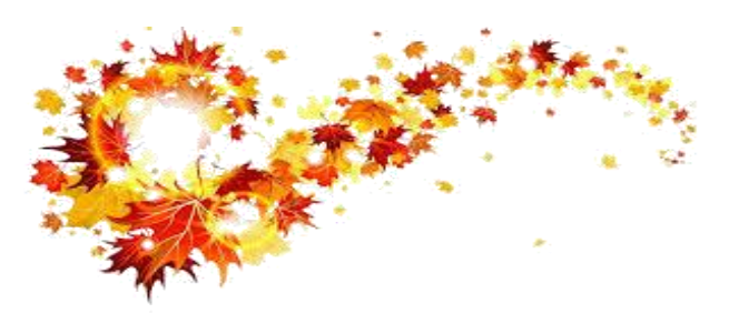
Grade Level News